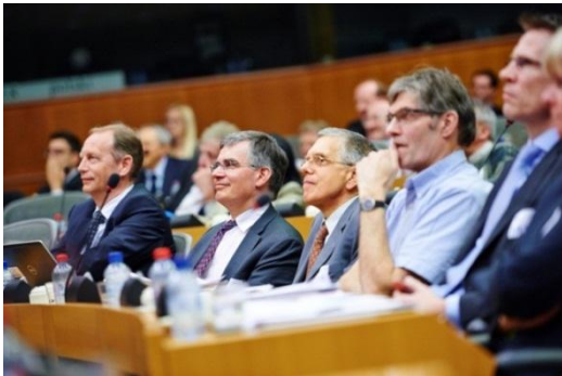
Participants of the CPR workshop.

On the 27 March, the Secretariat organised a Workshop in the European Parliament to open debate on the possibility to make available the DoP on websites. With all the branches of industry and the EC in attendance, the debate was facilitated by MEP Catherine Stihler, the CPR rapporteur.